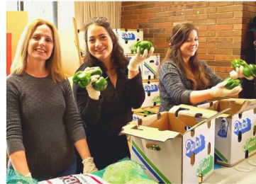
Food, Clothing, & Fresh Produce Distributions