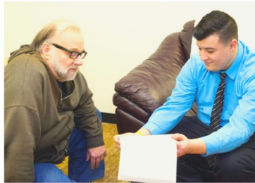
Behavioral Health Services Counseling Case Management Substance Abuse Treatment