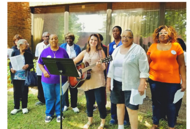
Health & Wellness Program Senior Drop-In Center Health Screenings