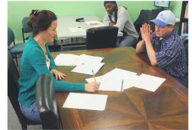
Education Resource Center Adult Literacy Workforce Development