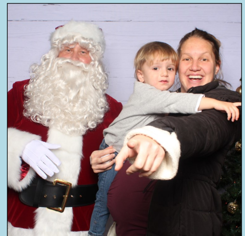
Over 300 people enjoyed a night of meeting Santa, singing and of course, the Tree Lighting!